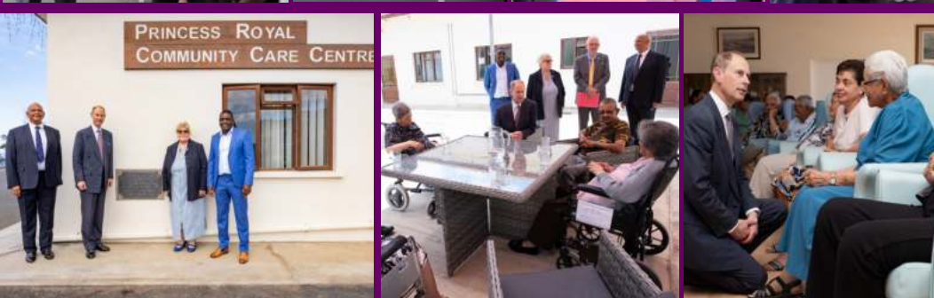
1225: Visits the Community Care Centre and learns about the role the Care Centre plays for local residents and its beneficiaries, and how investment has improved resources. Meets Care Centre staff, residents and residents from other social care establishments.