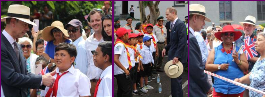
1042: HRH walks out onto Court House Terrace to address St Helena Community and receive locally-made gifts from local schoolchildren. Moves off stage to the Grand Parade for informal walkabout with the local community, including meeting groups of Scouts, Girl Guides, Church Lads & Girls Brigade, Pathfinders and school groups as well as many members of the St Helena Community.