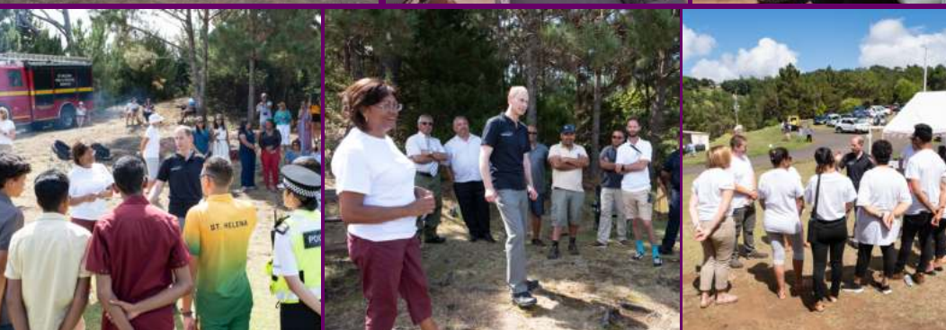
1420: Attends Duke of Edinburgh Ceremony at Rosemary Plain, meeting the DoE Award Authority as well as gathered groups of facilitators, recipients and young people interested in starting their journey.