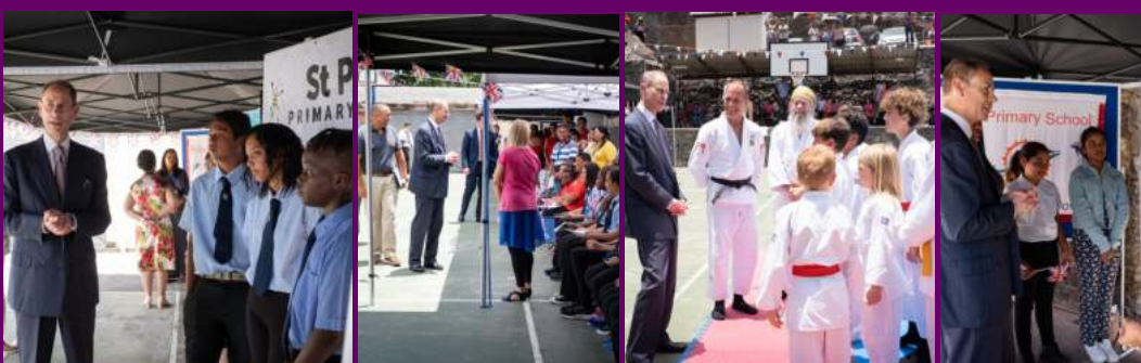
1126: The Duke enters New Horizons and learns about the work and focus of the organisation before moving to the Leisure Park to view various stalls and displays from local schools, Creative St Helena and the Judo Club. Stops at the St Helena Coffee Shop after departing New Horizons.