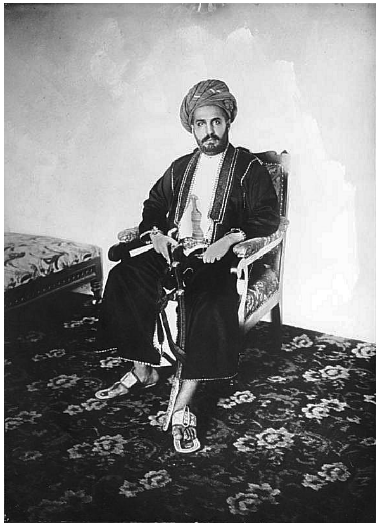
Bundesarchiv, Bild 105-D04009 Foto: Dabbertin, Weither | 1908/1918

governor Dixon. The latter complained the arrival of these exiles was entirely unexpected and in the absence of any instructions had placed them in military custody under guard in the lower block of the Officers Quarters (today Pilling School). Had the Colonial Office not instructed the disposal of the camp for the Egyptian “undesirables”, Dixon would presumably have housed Khalid’s party there. 30