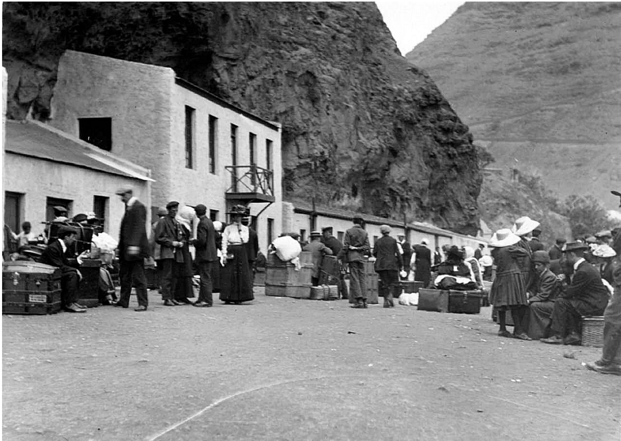
Papanui Passengers on the Wharf