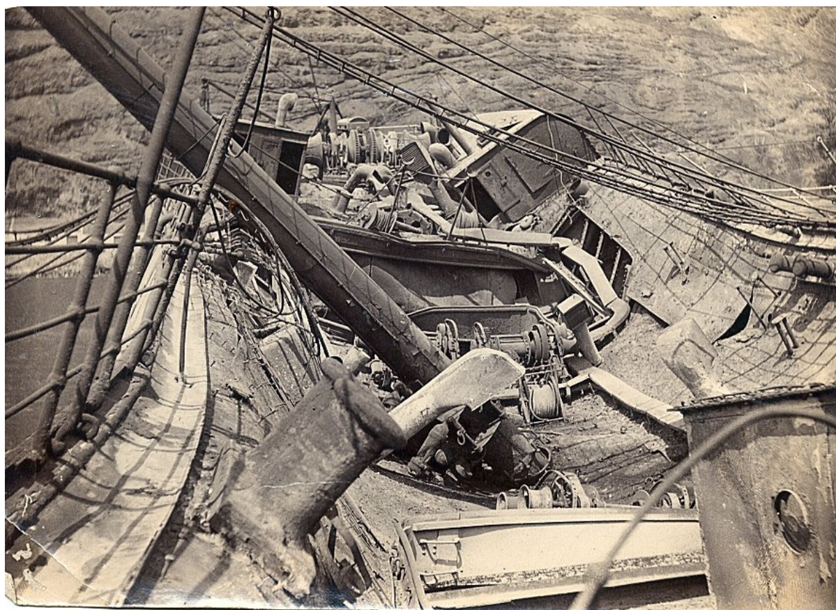
Fire-warped damage to the Papanui 19