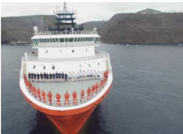
Photo on left - SPO's vessel crew, with the dive team and project manager from UK MOD, on the deck of Pacific Dolphin

On 26th June, both Pacific Dolphin and Pacific Supporter set sail for St Helena. The trip lasted seven days and the vessels experienced the full wrath of the South Atlantic in winter. The two SPO vessels were also joined by the Golden Oak, a 8,500gt product tanker, that would act as the reception vessel for the recovered oil.