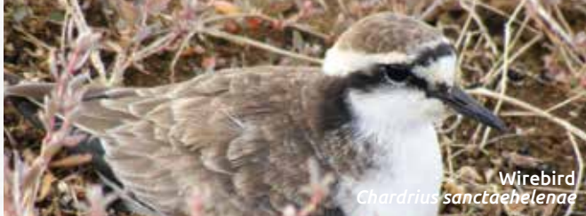
Wirebird Chardrius sanctaehelenae