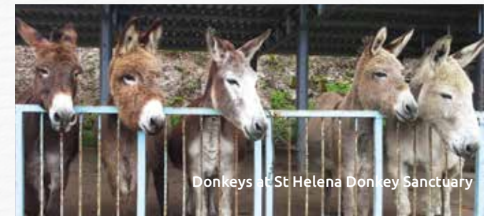
Donkeys at St Helena Donkey Sanctuary

The St Helena Donkey Sanctuary is always looking for support, as caring for the donkeys is a full time job. Walking with the donkeys or occasionally mucking out, grooming or assisting with hoof maintenance is a great support to the team. Alternatively it is possible to adopt a donkey for £20 for 1 year.