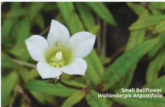
Small Bellflower Wahlenbergia Angustifolia

The Community Forest team at National Trust holds monthly volunteer days. An ambitious restoration project to reintroduce Gumwoods into severely degraded and barren land at Horse Point began in 1988 and is now the site of Millennium Forest. Since the year 2000 about 15,000 trees have been planted, many of them by the public. You too can get involved by sponsoring or planting a tree. Trees can be dedicated to the memory of loved ones or to mark a special event. To sponsor a tree costs £10.00. Personalised plaques and benches can be arranged by the Trust on request.